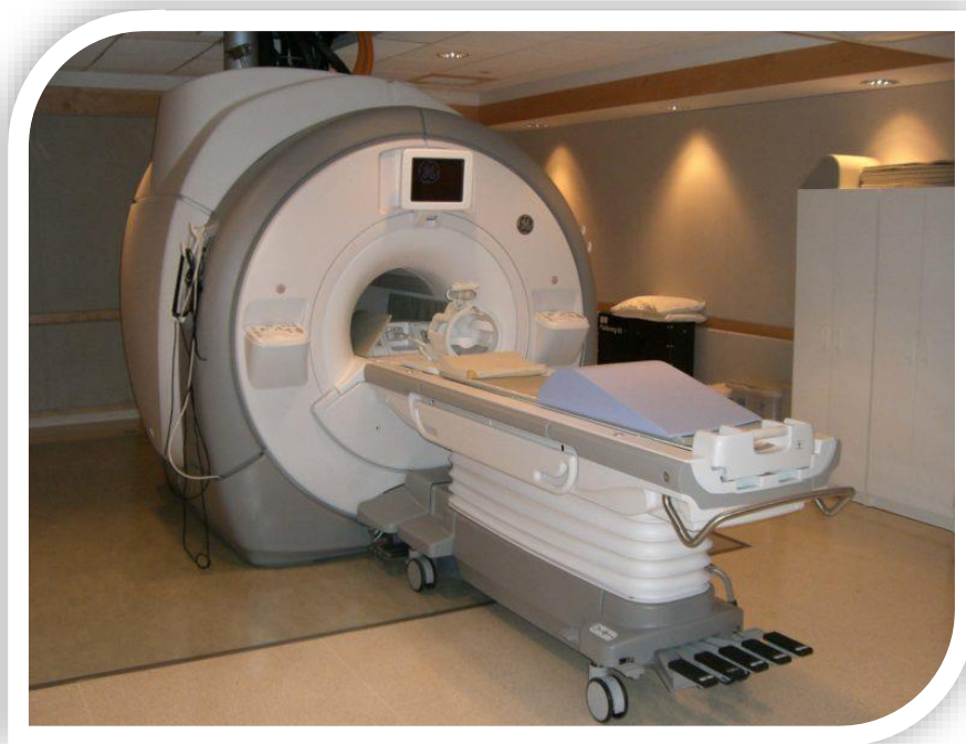
Pictured: Example of the MRI scanner used in the study to collect images of the brain.